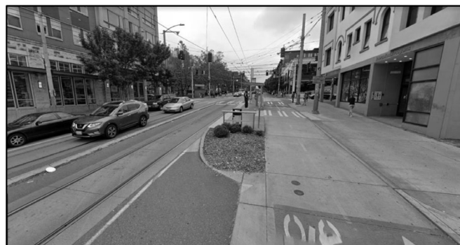
Figure 1 Before and after example of a road safety project: installation of two-way protected bike lanes and a road diet on Broadway in Seattle's Capitol Hill neighbourhood.

The intervention sites were in six of Seattle's seven City Council Districts, which reflect unique neighbourhood characteristics and provide a city-wide perspective. Two of the seven projects were from district 7 that includes the downtown commercial core with the city's heaviest concentration of retail and food service businesses. No suitable projects were identified in district 1 (West Seattle). Each intervention site was physically inspected by the lead author with pre and post street design features confirmed through review of Google Street View images. Figure 1 illustrates a road diet and two-way protected bike lane project included in our study.