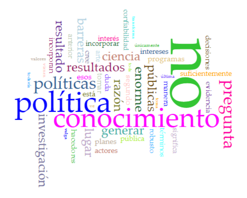
Figure 3 . Word cloud of the answer to the question: Why do health policymakers not incorporate research results into their plans and programs?

We identified seven emerging categories for understanding policymakers' responses in the thematic analysis. For the first question, the categories "untrustworthy results," "inaccessible results," and "existing interests" –expressing lack of access and confidence– explained why policymakers do not incorporate research findings in plans and programs. Regarding the second question, the categories "relevance of research findings" and "understanding and engagement" highlighted the primary factors for research utilization in health policymaking. For the third question, the categories "institutionalized dialogue" and "relevant experience" contributed to understanding what decision-makers and scholars need to do to incorporate research findings in health plans and programs (see Table 3).