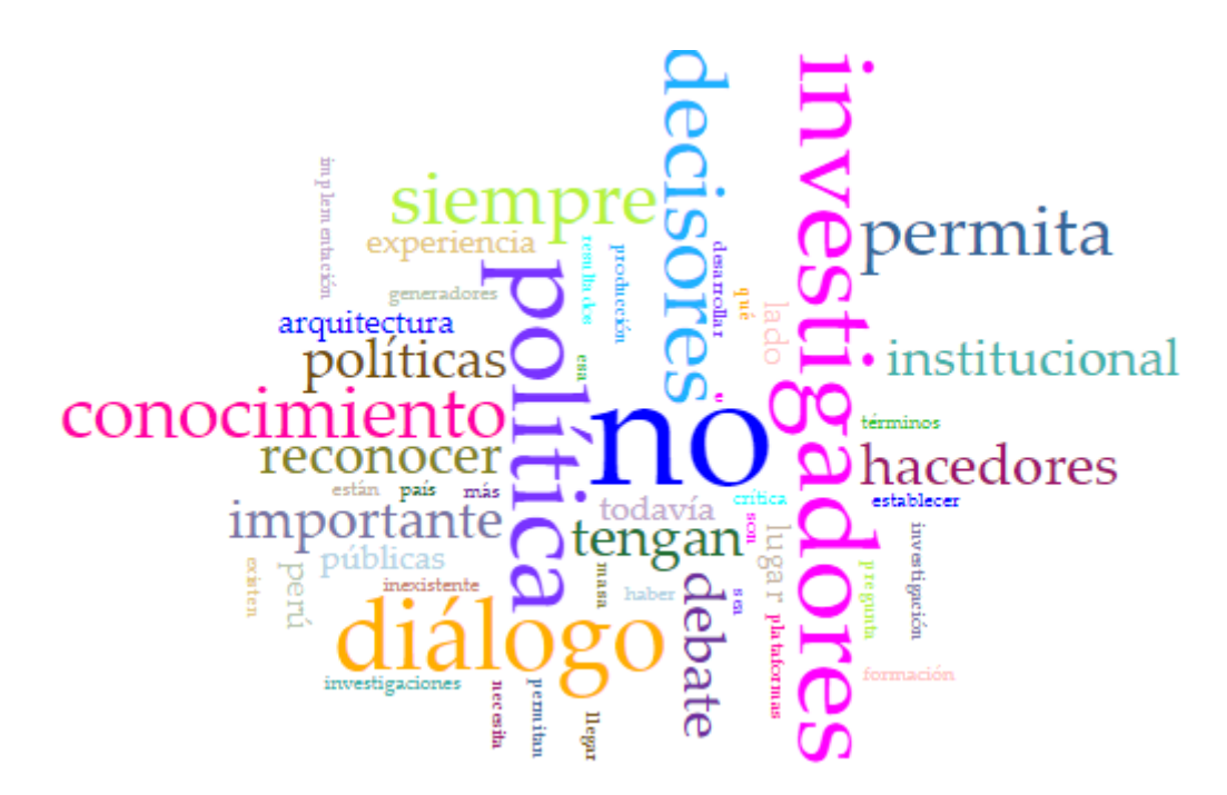
Figure 5 . Word cloud of the answer to the question: What should scientists and policymakers do to ensure research results are incorporated into programs?