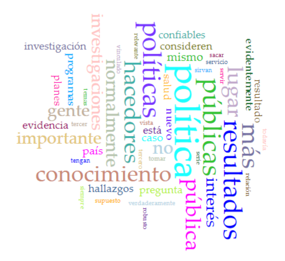
Figure 4 . Word cloud of the answer to the question: What does it depend on for health policymakers to incorporate research results into their programs?