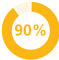
Oral and oropharyngeal cancer